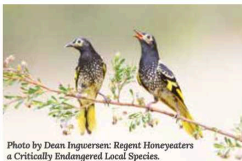
Regent Honeyeaters a Critically Endangered Local Species.